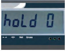
Function: Hold (4 modes)