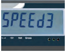
Function: Speed converter