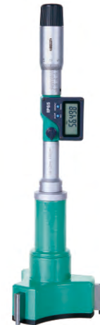
Type C 12-50mm, carbide measuring points three points