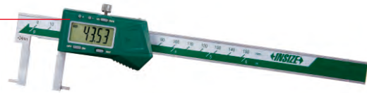
1121-150A type A