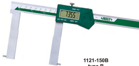
1121-150B type B