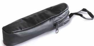
Leather bag ORA-A2103