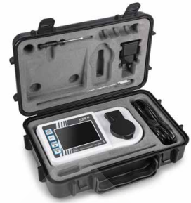
Transport and storage case