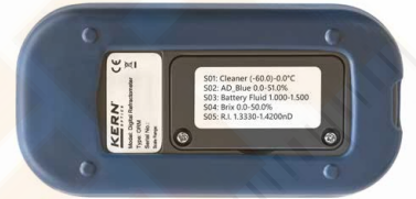
Rear view, screw-on battery compartment cover