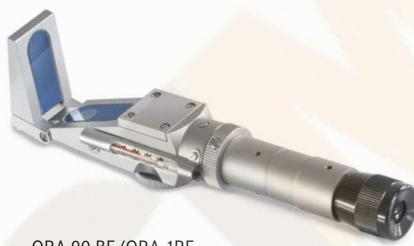
ORA 90 BE/ORA 1RE