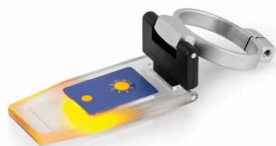
Prism coverplate with LED ORA-A1101