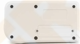
Rear view, screw-on battery compartment cover