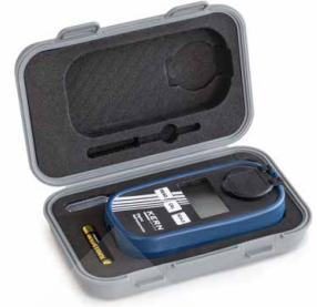
Transport and storage case