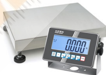
Robust industrial models from KERN for the very best integration into workflows