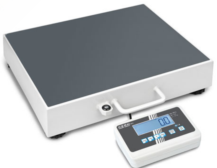
KERN MPC 300K-1LM