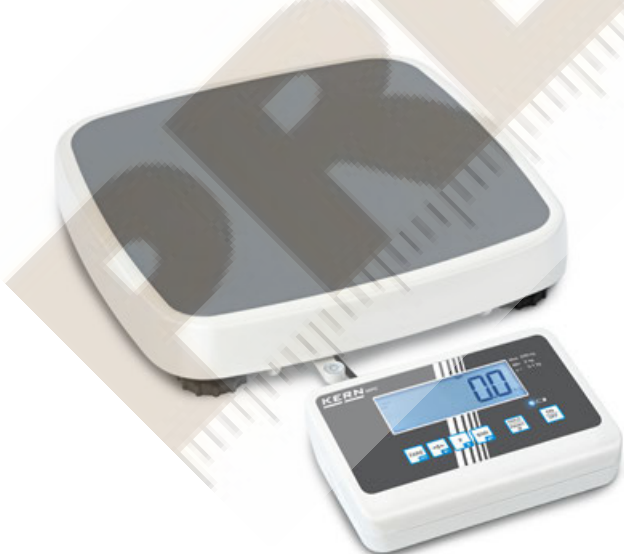
KERN MPC 250K100M

Compact personal floor scale – with approval for professional medical use in medical diagnostics, verification optional