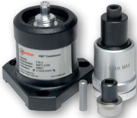
FMT 2 N-m

Flange Mounted Transducers (FMT) incorporate mounting points for securely fixing the transducer to the working surface. The transducer lead which comes attached to the transducer, is fitted with a high quality connector, suitable for attachment to TST, TTT and T-Box™ 2 instruments. FMTs are provided with precision square drive adaptors suitable for the calibration of torque wrenches.