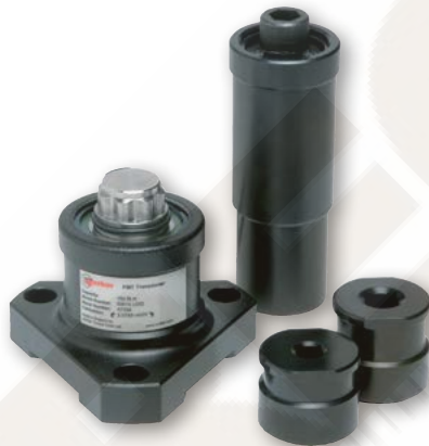
FMT 150 N-m