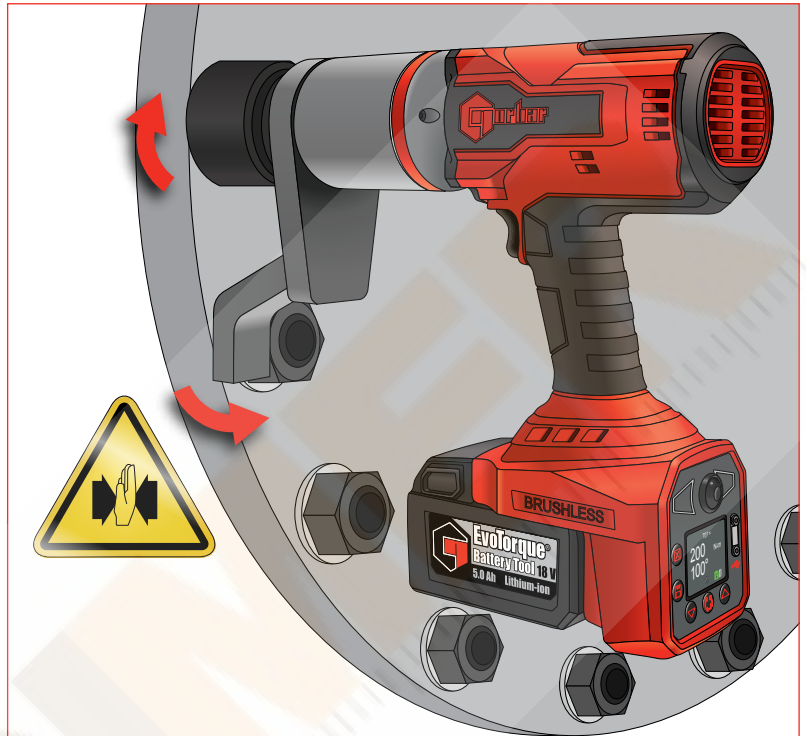
In the above example, 1,000 N·m torque output will result in a reactive force of 6,667 N at a point 0.15 m from the axis of rotation or 2,000 N at 0.5 m.

All of the standard reaction plates and feet supplied with standard Norbar tools have been designed to enable the multiplier’s use in a variety of environments. However, due to an infinite number of bolting arrangements, it is impossible to have one reaction device that will satisfy every customer’s requirement. See page 70-71 for when the supplied standard reaction is not suitable.