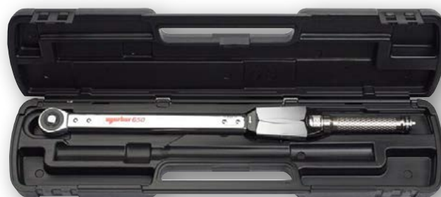
All models supplied in carry case