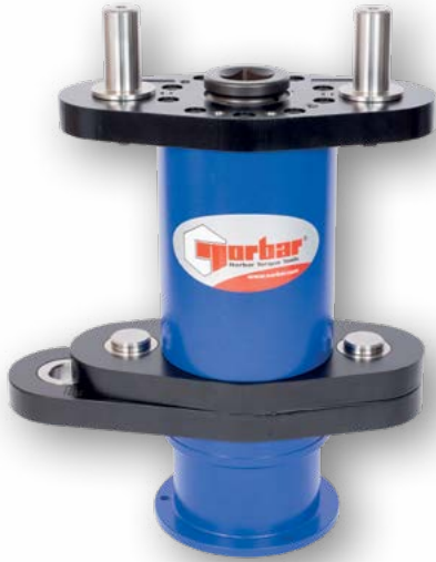
Universal Tool Test Rig (1½" M/F Static Transducer required (not included))