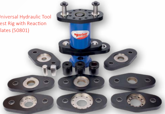
Universal Hydraulic Tool Test Rig with Reaction Plates (50801)