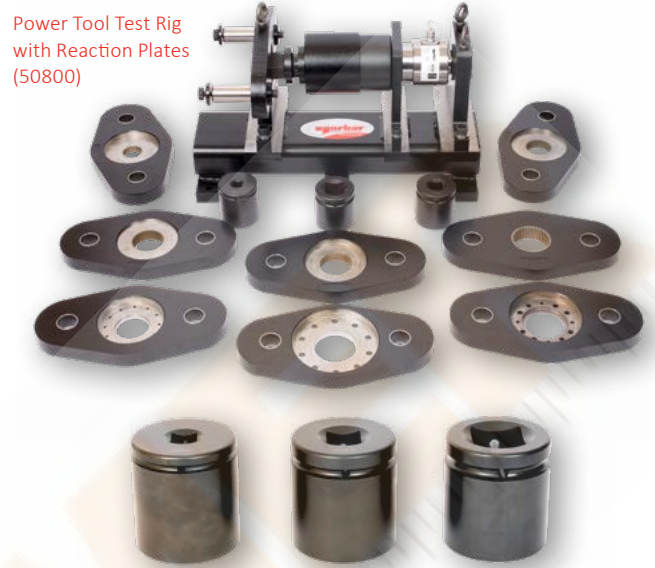
Power Tool Test Rig with Reaction Plates (50800)