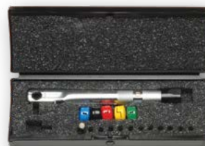
Model 5 'P' Type in storage case