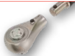
Compatible with Norbar's huge range of spanner end fittings