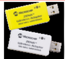
Unique Torque Data System software enables data management and archiving to a PC