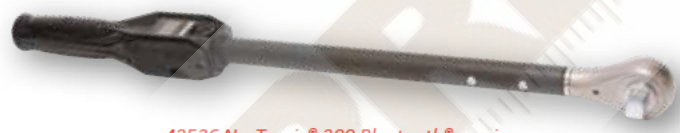
43536 NorTronic® 200 Bluetooth® version